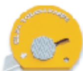
TK-3M ▲Touch Knife(附磁鐵)