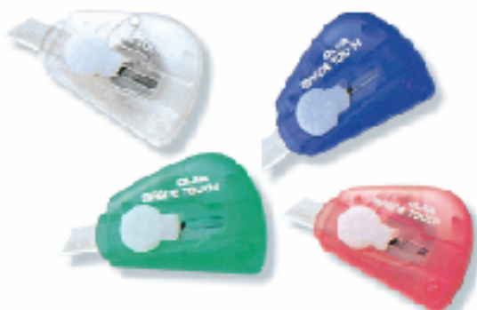
95BC ▲Touch Knife(附磁鐵)